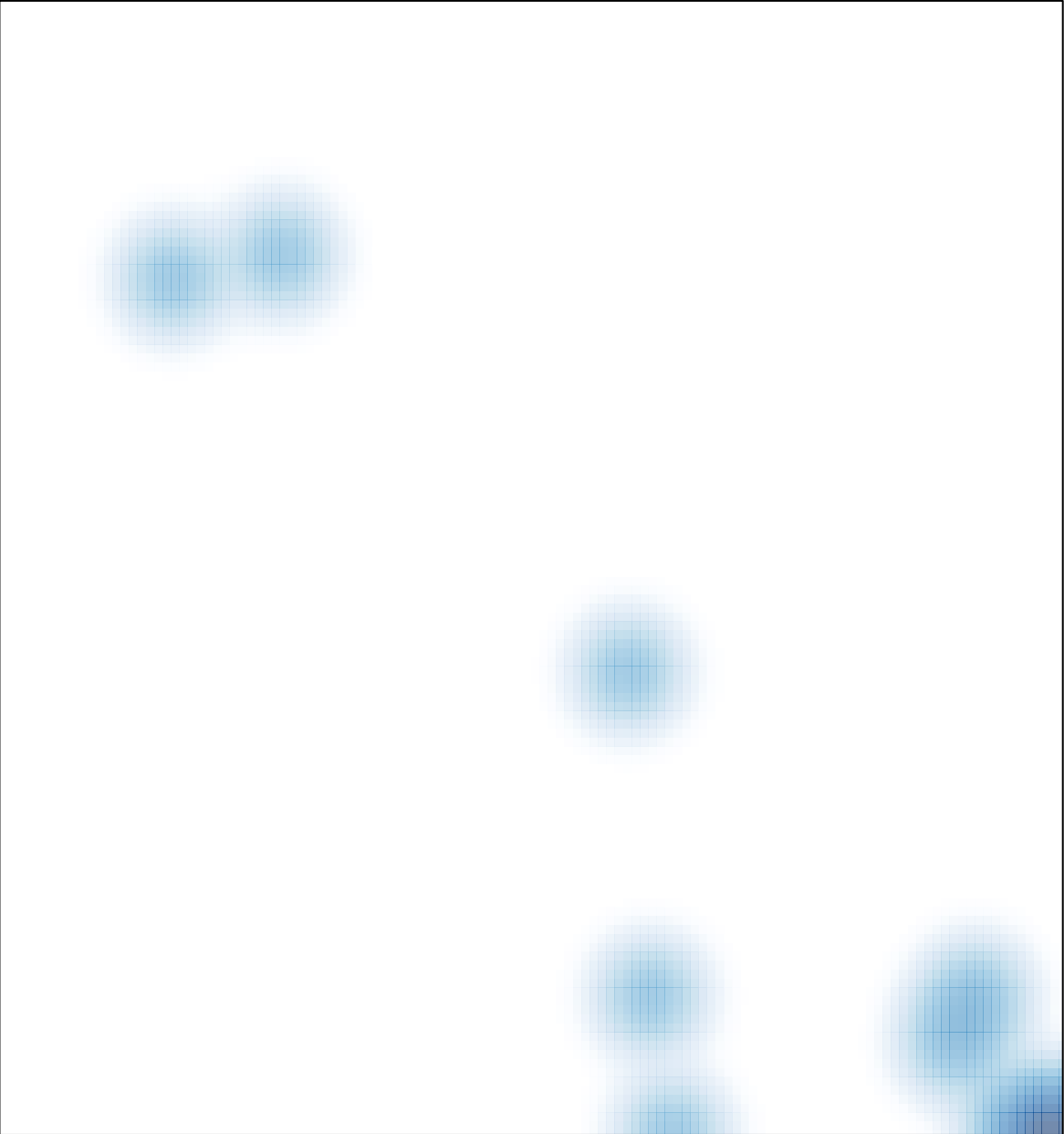
# features = 12 , max = 3